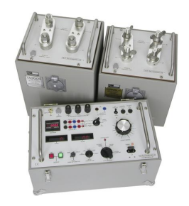
PCU1/E, LU500 and LU3000

Where higher currents and powers are required for primary injection, 7kVA and 20kVA primary injection systems are available. The PCU1/E and PCU2/E systems have separate control and loading units, allowing a wide range of load conditions to be covered with different loading units.